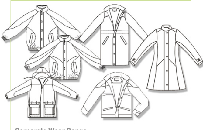
Corporate Wear Range